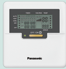
Wired Remote Control CZ-RD514C